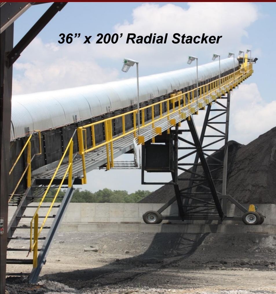
36" x 200' Radial Stacker